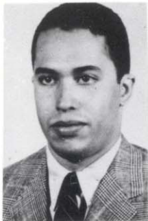
Herman E. Branson